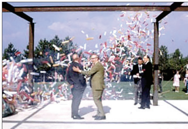
A balloon release marked the occasion in 1969 when construction began on the Whispering Hills Pro Shop.