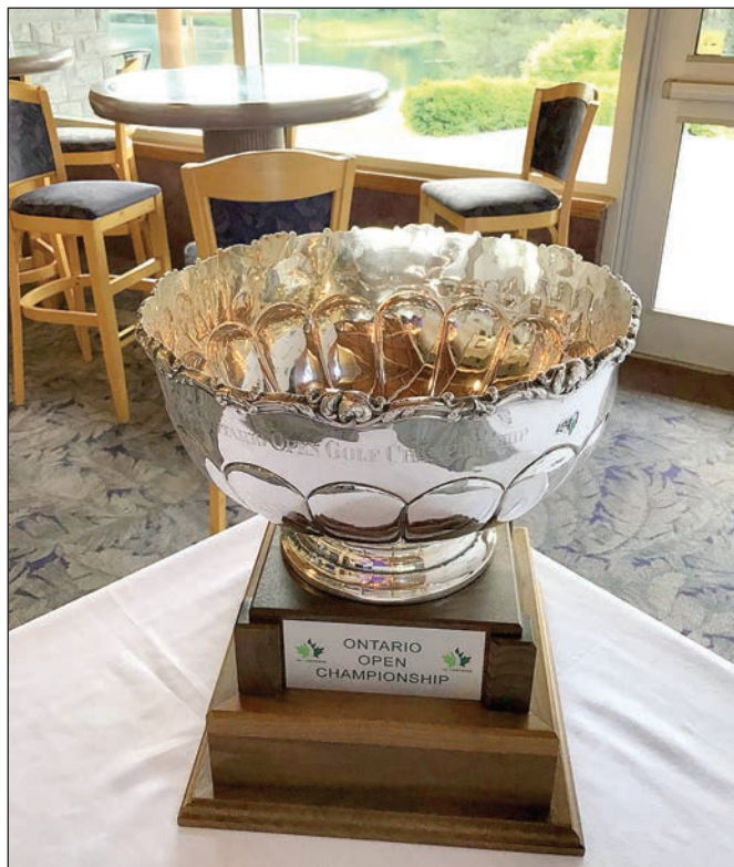
The Ontario Open Championship trophy was on display during a June 25 Media Day at Woodington Lake Golf Club.