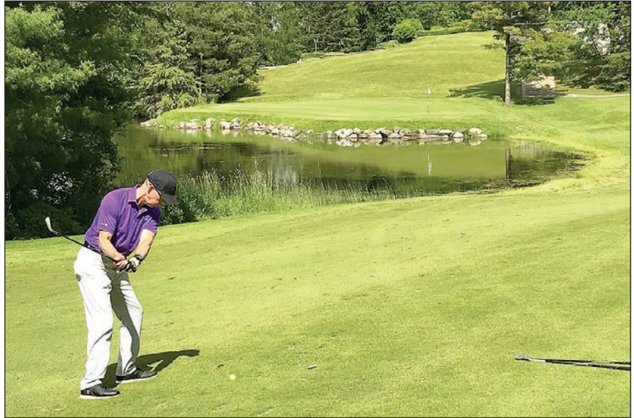
The 18th hole on the Legends course at Woodington Lake is a challenging and beautiful finishing hole.

The championship will feature one practice round and 36 holes of championship stroke play across four open divisions.